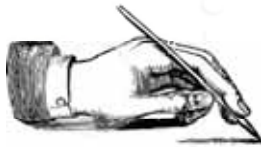
188811/Free-Download.com * 2017 09/28