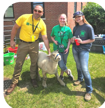
Picture taken at VA Dairy Days